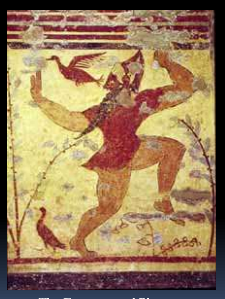
The Etruscan god Phersu, whence the term "person"