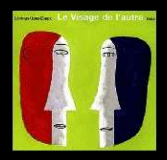
Le visage de l'autre (The face of the Other)