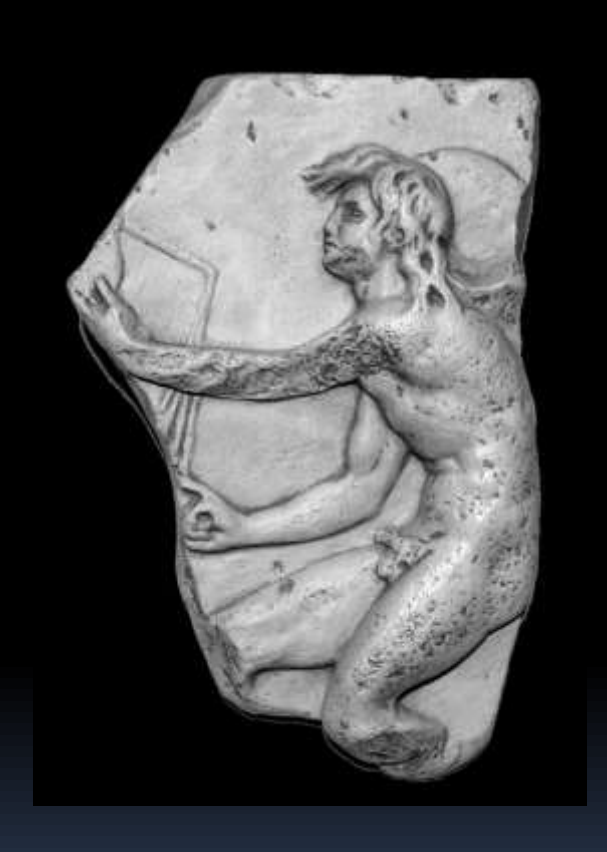
Kairos, Greek god of the fertile moment