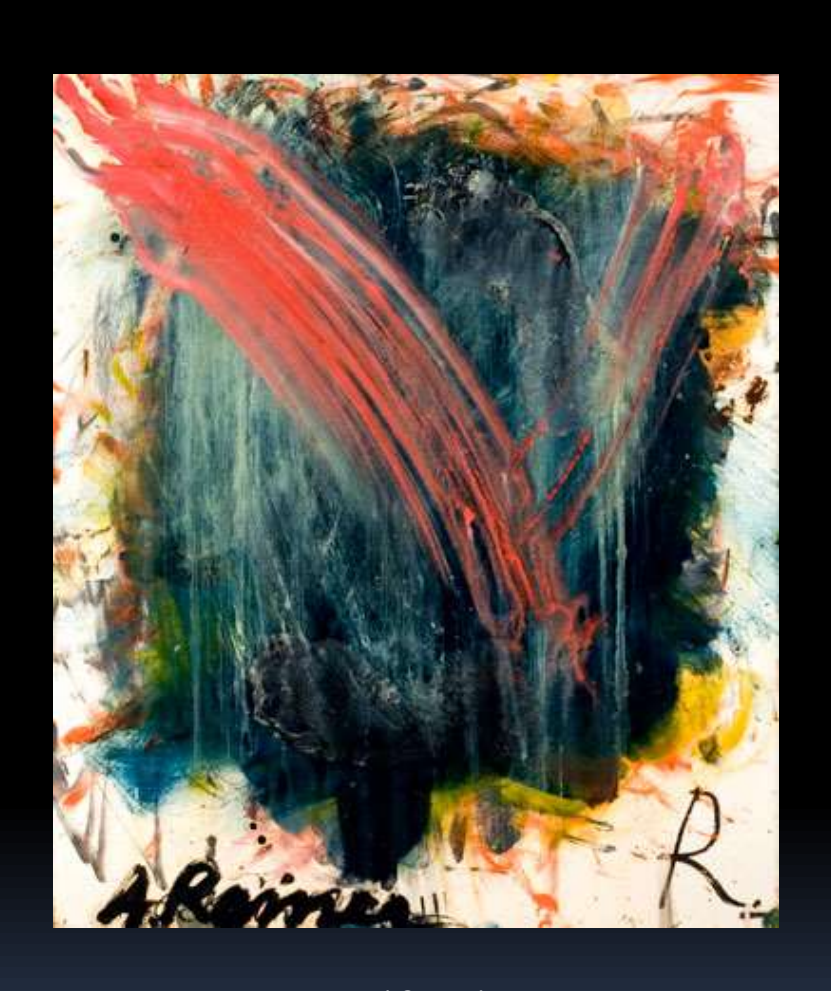
Arnulf Rainer, Fingerschmiere