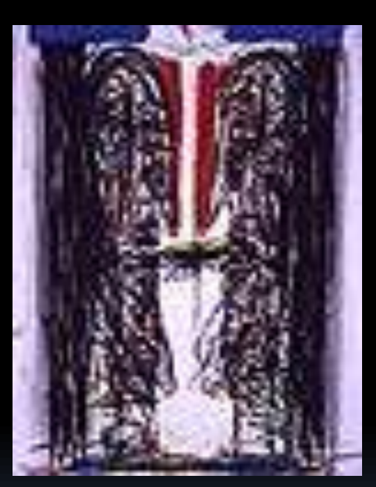
F. Ringel, Gespräch (Conversation)