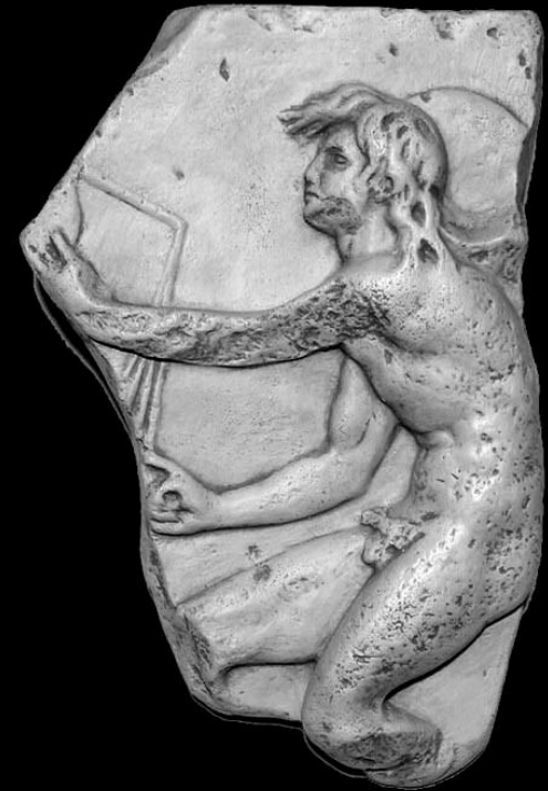
Kairos, Greek god of the fertile moment