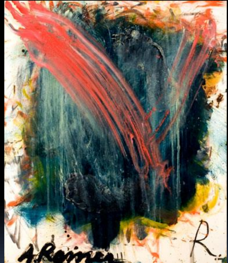
Arnulf Rainer, Fingerschmiere