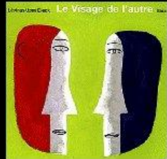
Le visage de l'autre (The face of the Other)