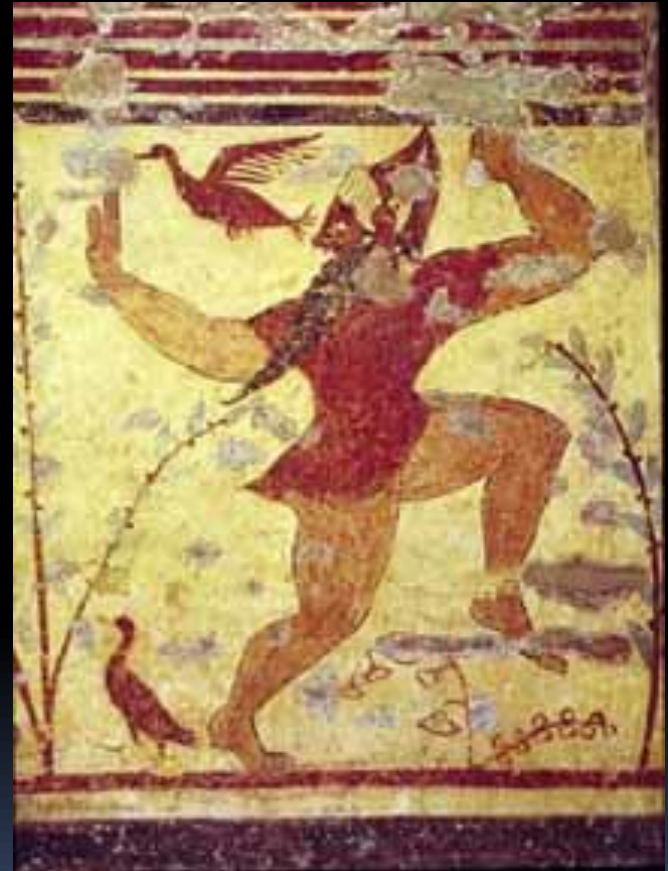
The Etruscan god Phersu, whence the term “person”